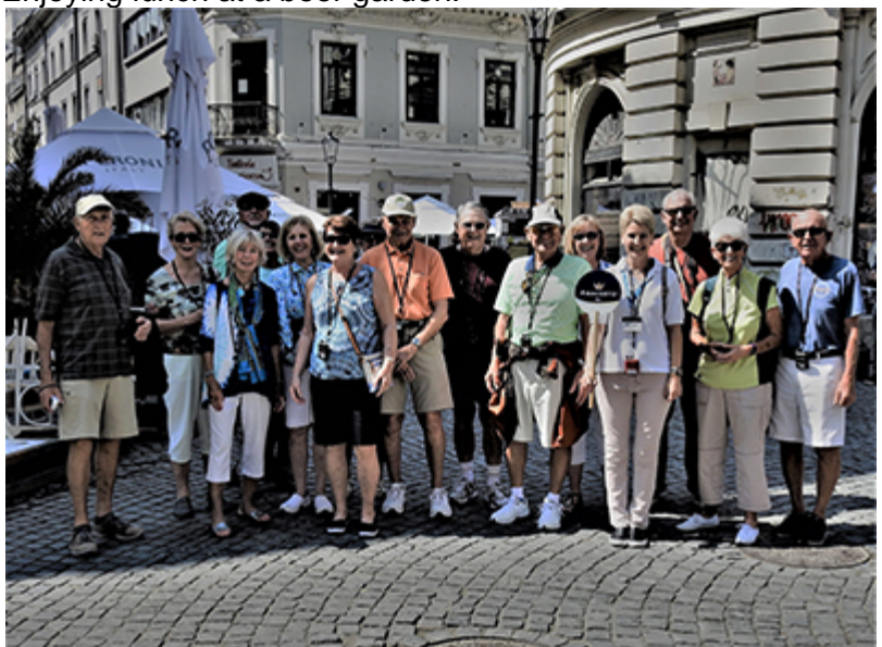
The MMC group with their guide.