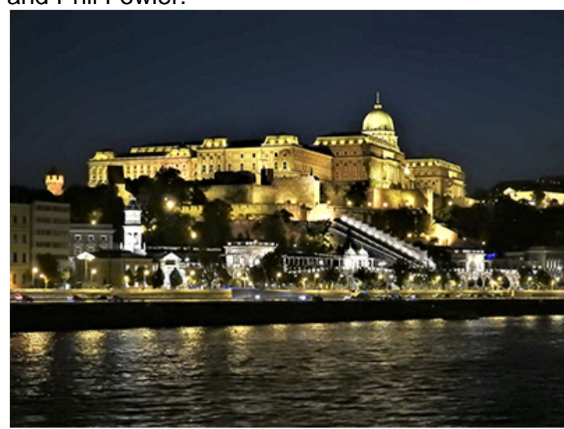
Budapest at night