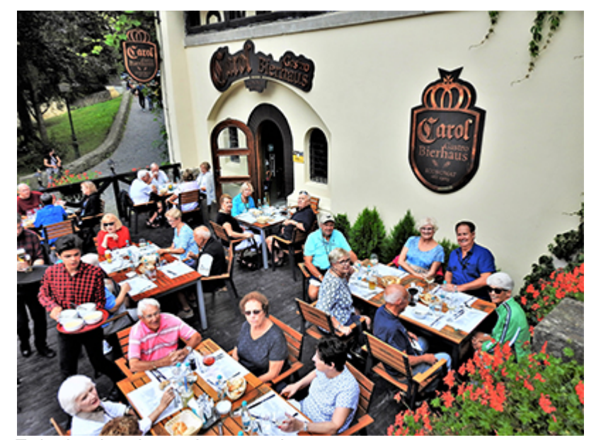
Enjoying lunch at a beer garden.