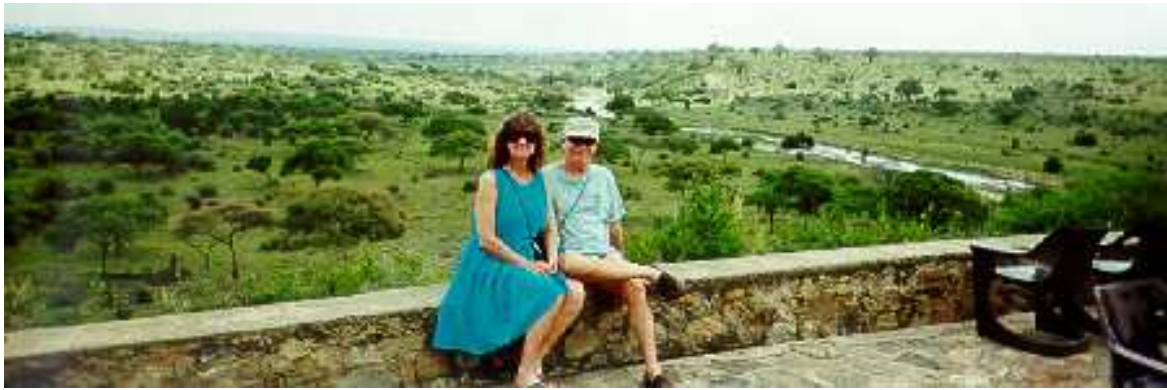
Tarangire River Valley as seen from the lodge